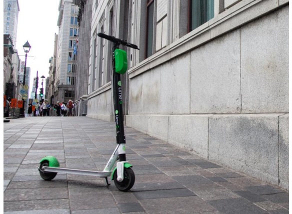
A Lime e-scooter left on the sidewalk in Old Montreal.

'The scooters cluttering the streets, some of them getting destroyed, this is part of a disruption that we're kind of as a sector, as an industry, trying to sort out'